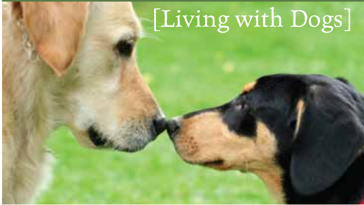
[Living with Dogs]

A quarterly newsletter bringing you informative treats from the dog world, and keeping you up-to-date with our services